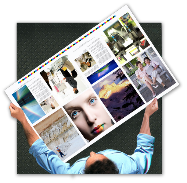
Let one of our experts work with you to help you achieve a higher level of performance from your formulation challenges